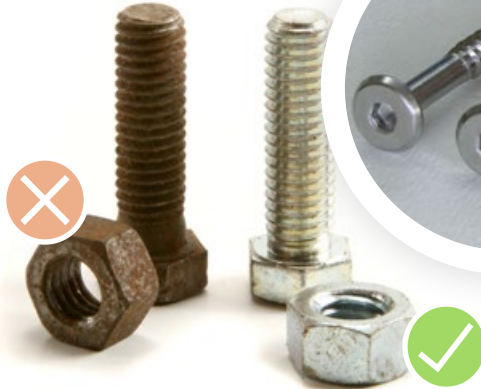
316 Marine Grade