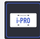
License Plate Recognition