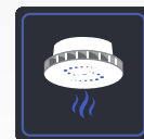
Vape Detection 2