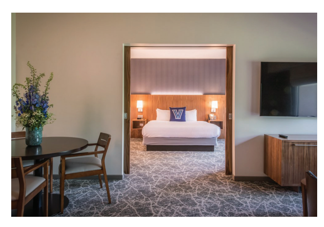
Our team worked closely with the university to create warm, modern and family-friendly settings that enhance the overall appeal of this property.