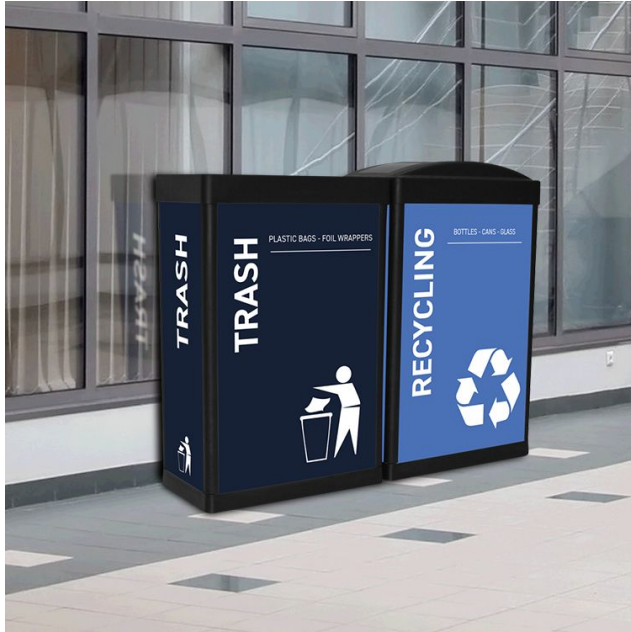
ErgoCan 2 stream with the standard Elite Panels