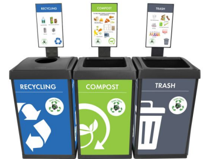
Customization for Mamaroneck School District