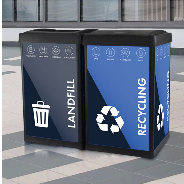
ErgoCan 2 stream with the standard Synergy Panels