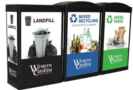
Customization for Western Carolina University

Unit Available in Single Stream to Multi-Stream Waste and Recycling configurations. Please see next page for more examples.