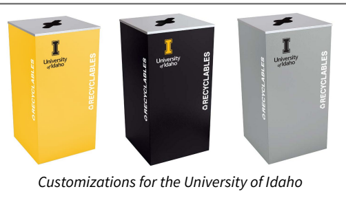
Customizations for the University of Idaho