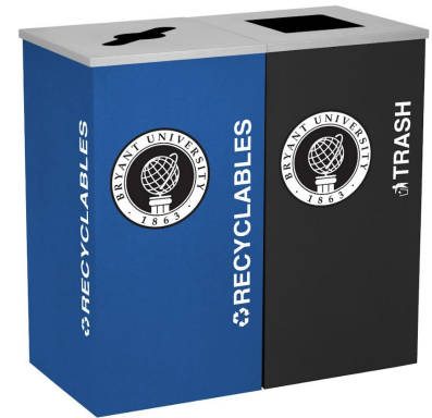
Customization for Bryant University

Unit Available in Single Stream to Multi-Stream Waste and Recycling configurations. Please see next page for more examples.