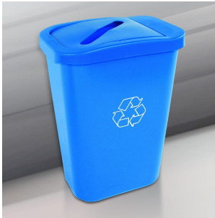
10 Gallon Deskside Sorter Item #: Deskside Sorter 10