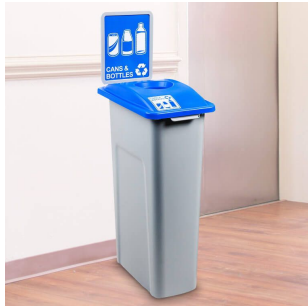
Large Simple Sort Item #:SIMPLE SORT