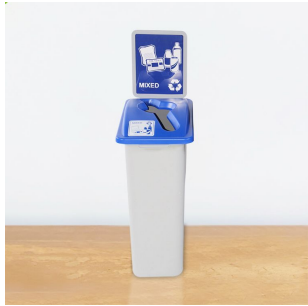
Small Simple Sort Item #:SIMPLE SORT-1S