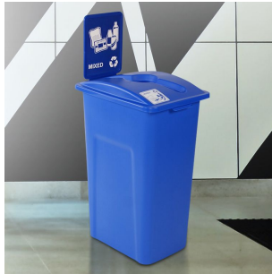
XL Simple Sort Item #:SIMPLE SORT XL