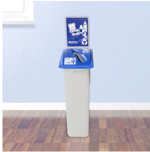
Medium Simple Sort Item #:SIMPLE SORT-1M