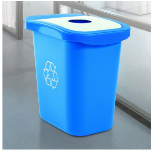
7 Gallon Deskside Sorter Item #: Deskside Sorter 7