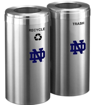
Customization for Notre Dame University

Unit Available in Single Stream to Multi-Stream Waste and Recycling configurations. Please see next page for more examples.